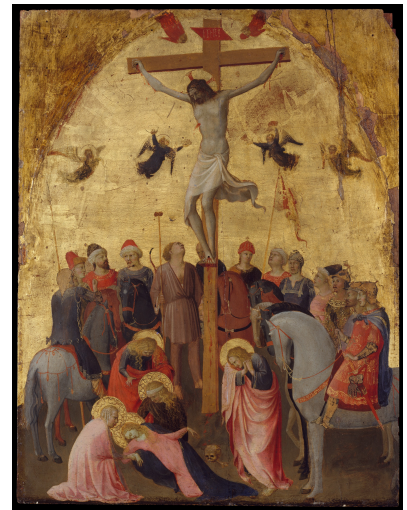
Fra Angelico, The Crucifixion , 1420-23.